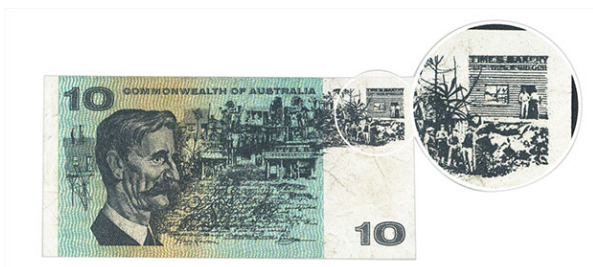
Figure 3: A 'Times Bakery' Counterfeit