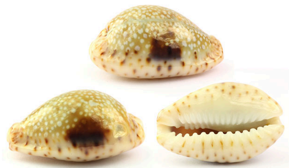
Figure 1: Cowrie Shells

The earliest forms of paper money used in Australia were not fixed denomination banknotes as we know them today, but were more akin to promissory notes or personal IOUs. They were redeemable in coin and issued either by government authorities in exchange for produce, or by private individuals, with the latter often just hand-written on pieces of paper. The lack of any serious security features on these notes predictably led to forgeries. On 1 October 1800, the Governor of the Colony of New South Wales, Captain Philip King, noted that '[due to] the indiscriminate manner in which every description of persons in the colony have circulated their promissory notes ... numerous forgeries have been committed, for which some have suffered, and others remain under the sentence of death'. While Governor King passed orders designed to regularise issuance, privately issued, hand-written notes continued to circulate,